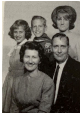
The Frost Family (from the 1963 directory)