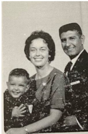
The Bambini Family (from the 1963 directory)