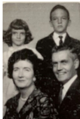
The Shepherd Family (from the 1963 directory)